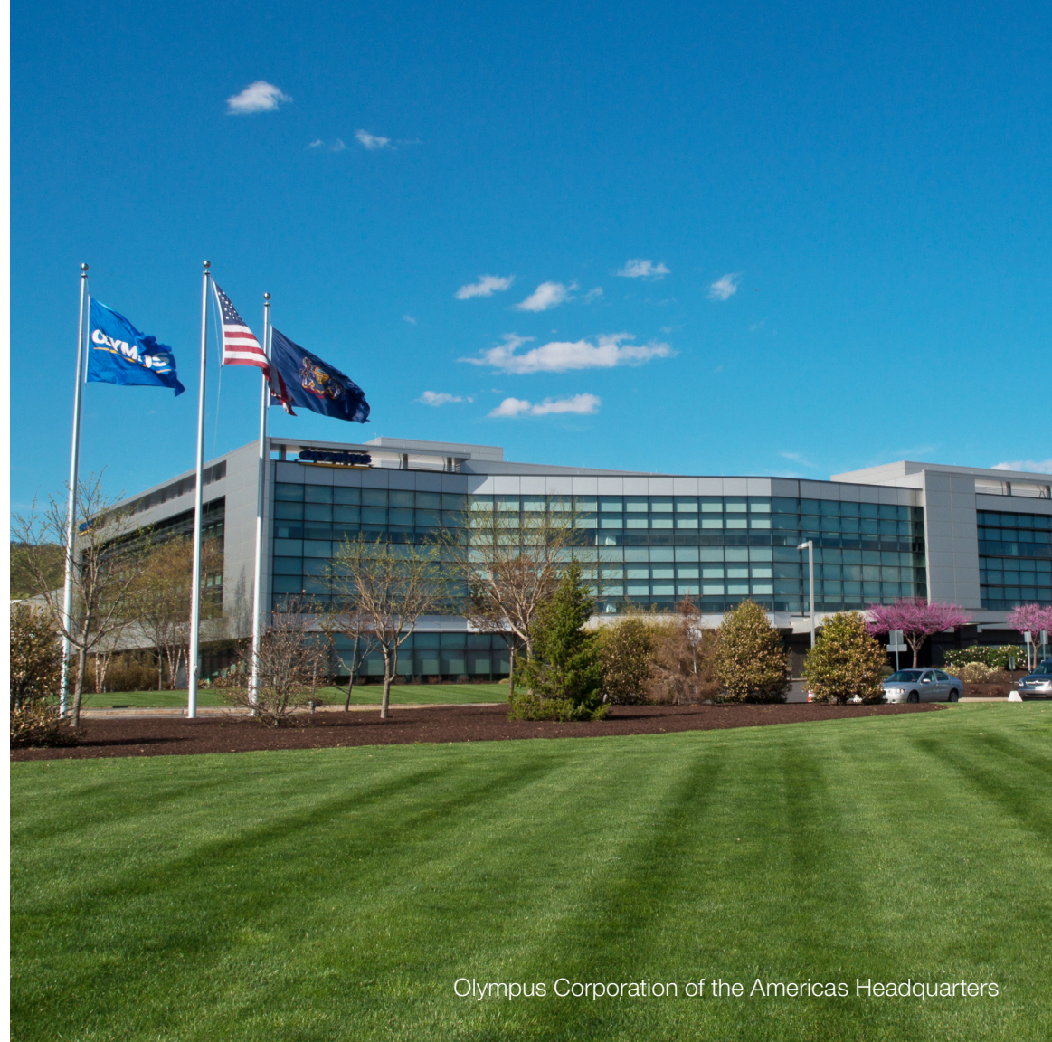
Olympus Corporation of the Americas Headquarters